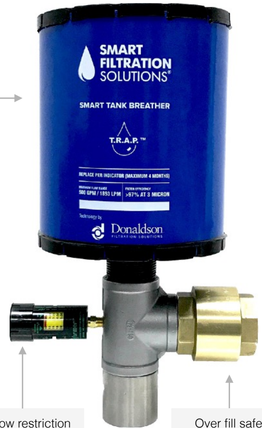
Air flow restriction indicator